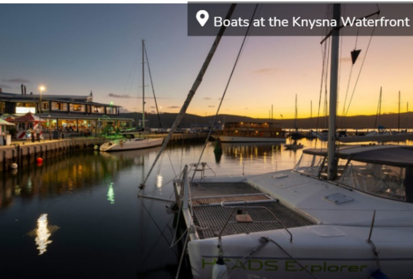
Boats at the Knysna Waterfront