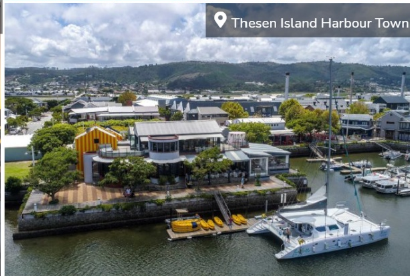
Thesen Island Harbour Town