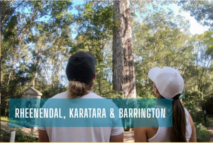
RHEENENDAL, KARATARA & BARRINGTON