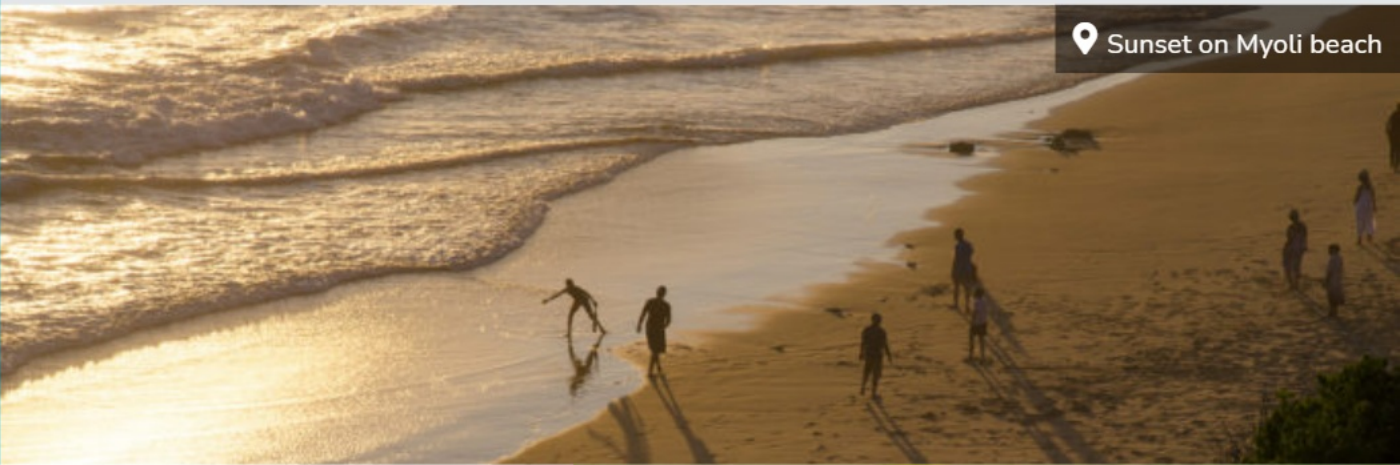
Sunset on Myoli beach

The greater Knysna falls within the Lakes section of the Garden Route National Park. With SANParks as custodians, the park has un-gated borders and residents and visitors can move freely to experience one of the most exquisite protected areas in South Africa. Think lush forests, lakes, estuaries and lagoons, 11 splendid beaches, a rich and varied bird, marine- & estuarine life – it’s a nature lover’s paradise.