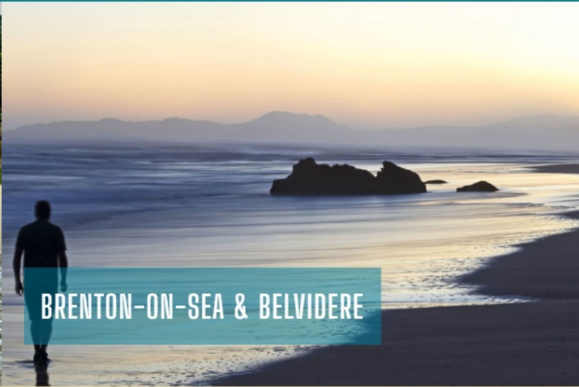
BRENTON-ON-SEA & BELVIDERE